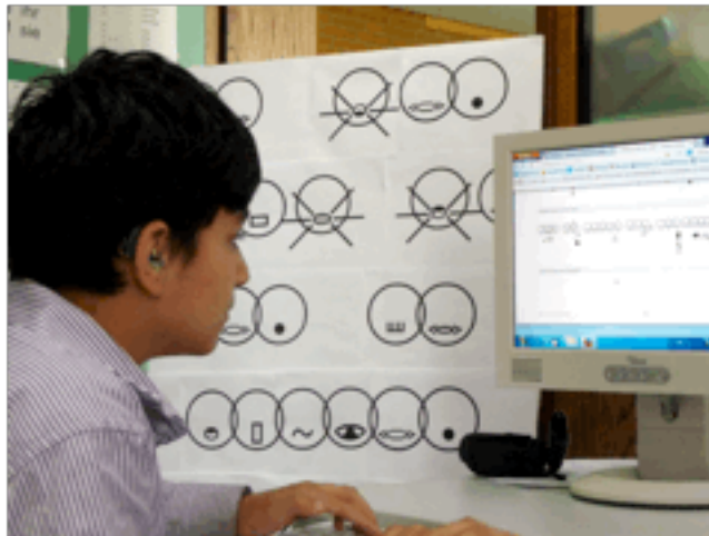
One of my students working on his own with the Delegs Editor program

It is my pleasure to present live at the SignWriting Symposium via the internet. I wish to practically demonstrate how easy it is now to design and create bilingual documents between written spoken and sign languages using the Delegs Editor.