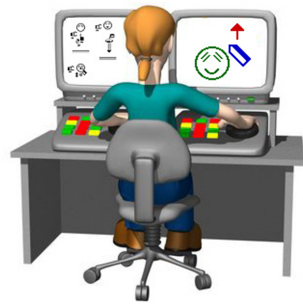
Work in a Private SignPuddle!