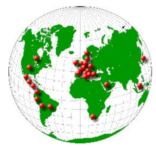
SymbolBank, in SignBank, is the database that stores the International Movement Writing Alphabet (IMWA), used to write hundreds of Sign Languages around the world.