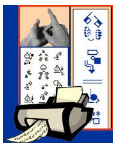
SignBank can be purchased or downloaded for free on the web.

One of the ten databases in SignBank is the SignSpelling Database. It stores information on the order of symbols inside each sign. The data from the SignSpelling database combines with the data in the SymbolBank database to make sorting and printing large, multilingual Sign dictionaries possible.