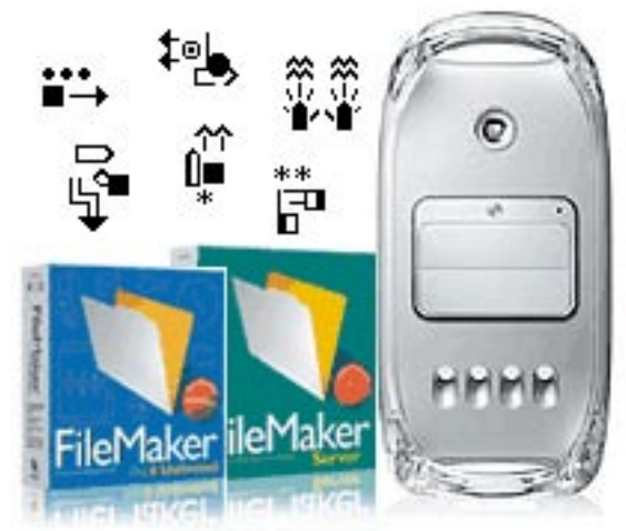
FileMaker Pro & Apple Macintosh have made it possible to serve SymbolBank on the web!