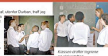
Klassen drøfter tegnene

Siden har skolen brukt dette i sin undervisning, der de har 11 ulike tegnspråk og diverse talespråk.