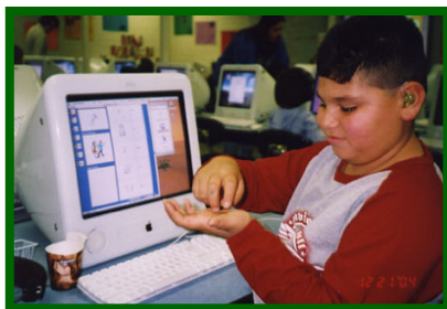
Deaf children use our books and software.

Center for Sutton Movement Writing, Box 517, La Jolla, CA. 92038 Sutton@SignWriting.org • www.SignWriting.org • www.SignBank.org voice: 858-456-0098 • fax: 858-456-0020 • D-Link vp: 66.27.57.178